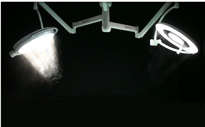
OPTIMISED FOR THE OPERATING ROOM